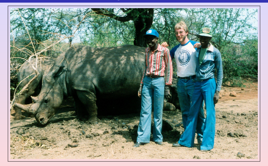
What is your passion?

DE and AK (UD) An introduction to Senior Senior 10 / 14