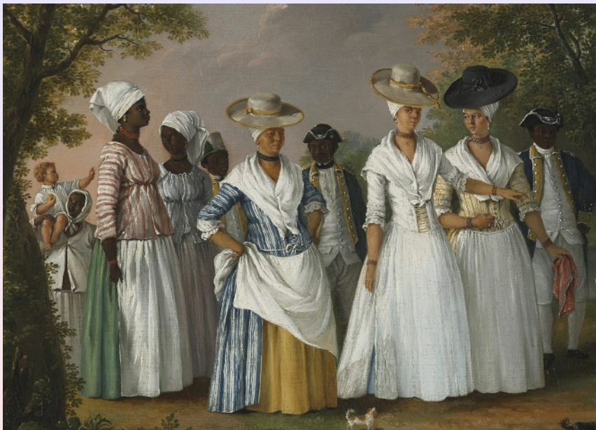
Agostino Brunias - Free Women of Color with their Children and Servants in a Landscape