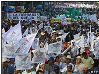
Mexicans are angry at the rise in price of their staple food

President Felipe Calderon has said the government will clamp down on hoarding and speculation to ease the problem.