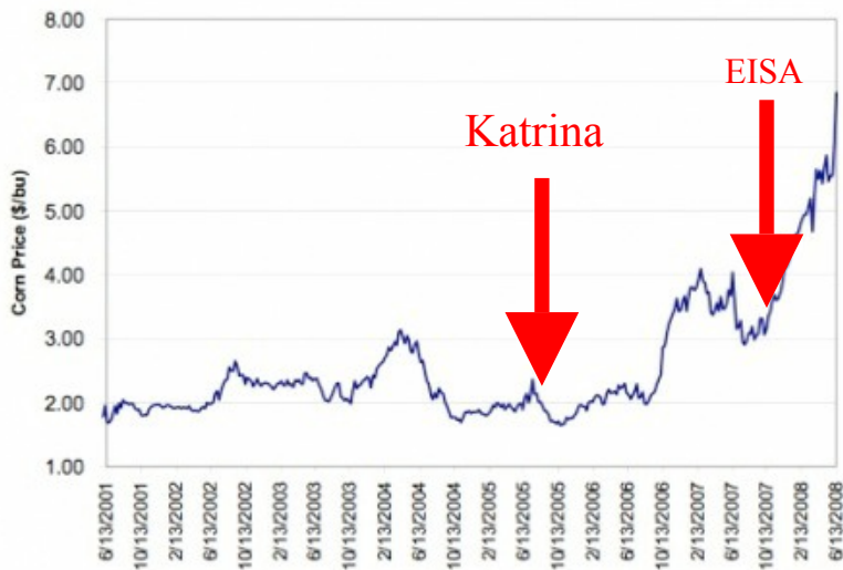
Figure 4. Cash Corn Prices--Illinois