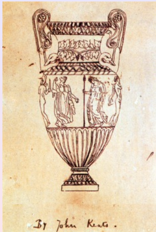
Sosibios vase, Louvre museum, France (Wikipedia)