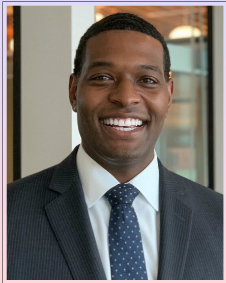
New EPA Head Michael Regan