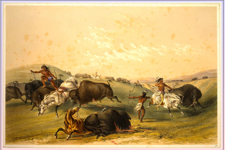
Painting by George Catlin (1796-1872), painted c.1832-39.